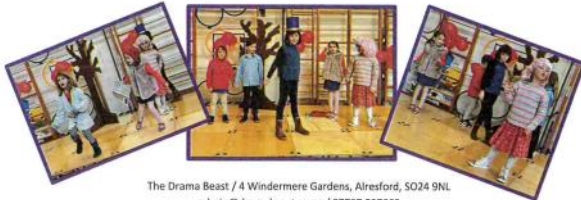
The Drama Beast / 4 Windermere Gardens, Alresford, SO24 9NL admin@dramabeasts.com / 07787 537083